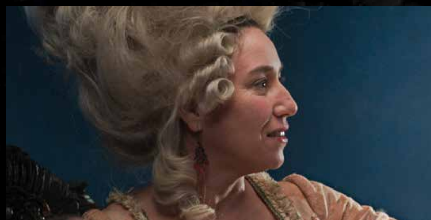
LOLA DUEÑAS (LUCIANA PIÑARES DE LUENGA)

Daniel Giménez Cacho is a Spanish-born Ariel award winner Mexican actor who has starred in several films by the most important hispanic filmmakers like Guillermo Del Toro, Alfonso Cuarón, Jorge Fons and Pedro Almodóvar, such as LA MALA EDUCACIÓN (2004) or Y TU MAMÁ TAMBIÉN (2001), where his voice is heard as the narrator. THE SUMMIT (Santiago Mitre, 2017) is his latest work with the Argentinean industry recently premiered at Cannes 2017. Giménez Cacho also appeared in LA HORA MARCADA, a TV show written and directed by Alfonso Cuarón and Guillermo Del Toro.