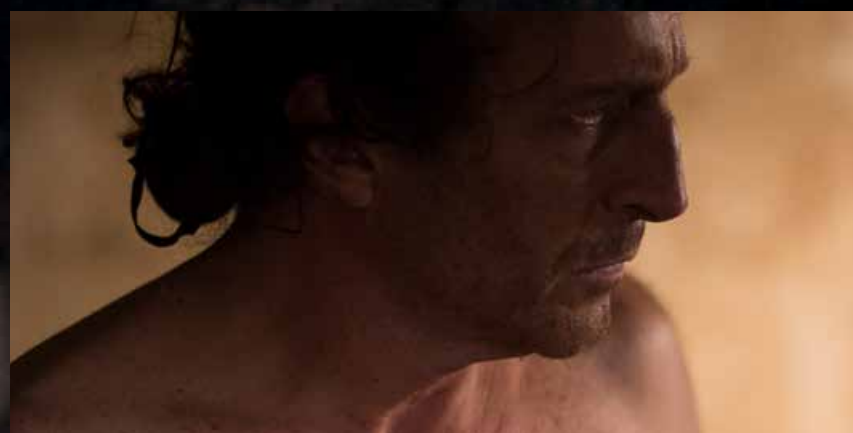
DANIEL GIMÉNEZ CACHO (ZAMA)

Daniel Giménez Cacho is a Spanish-born Ariel award winner Mexican actor who has starred in several films by the most important hispanic filmmakers like Guillermo Del Toro, Alfonso Cuarón, Jorge Fons and Pedro Almodóvar, such as LA MALA EDUCACIÓN (2004) or Y TU MAMÁ TAMBIÉN (2001), where his voice is heard as the narrator. THE SUMMIT (Santiago Mitre, 2017) is his latest work with the Argentinean industry recently premiered at Cannes 2017. Giménez Cacho also appeared in LA HORA MARCADA, a TV show written and directed by Alfonso Cuarón and Guillermo Del Toro.